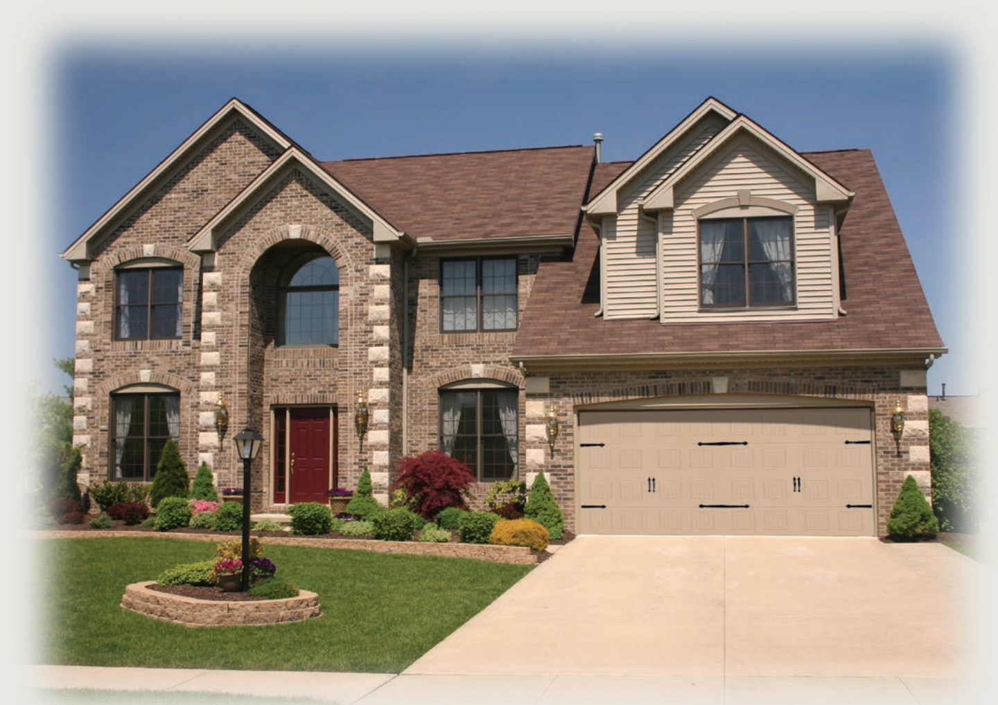
Sandstone, no design insert, optional decorative hardware